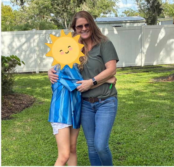
Another successful match with Big Brothers Big Sisters!