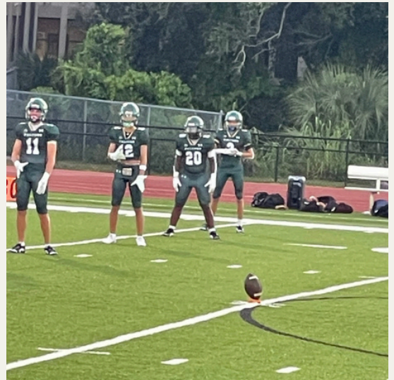
Sports offer foster children more than just time on the field: they provide healing and confidence.