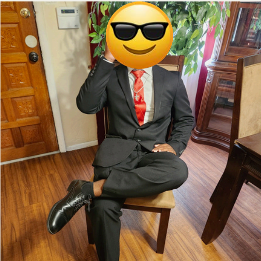
Looking sharp and ready for Homecoming