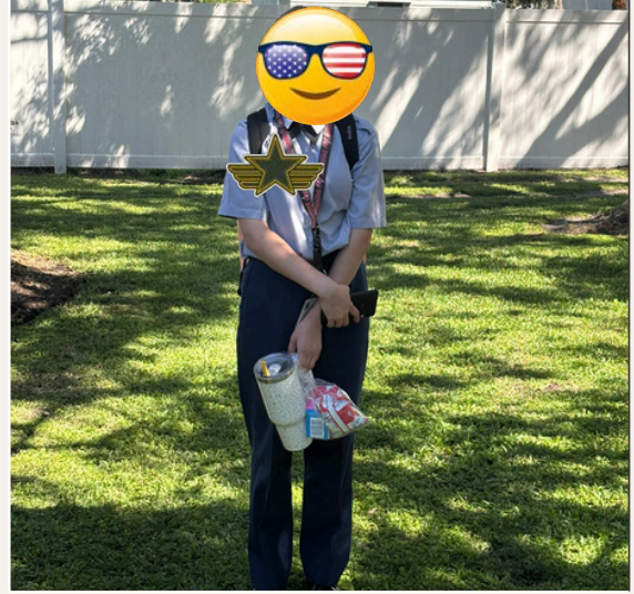
We are so proud of this kiddo's hard work in JROTC!