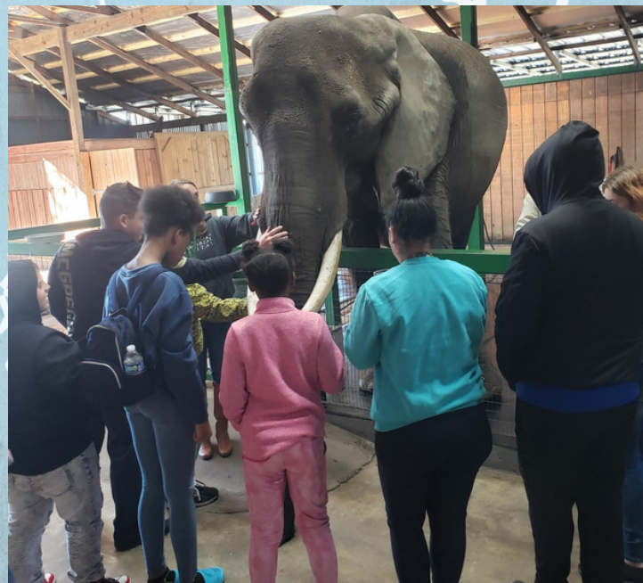
Outing to Myakka Elephant Ranch for our foster children. They loved engaging in elephant therapy!